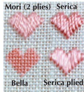
PLAY WITH TEXTURES: This photo shows the different weights and textures of the Kreinik silks, including the two ways of using Silk Serica.

After separating the Silk Serica® into 3 plies you will notice the soft ripples produced by the natural twist of the silk. This rippling effect is reminiscent of antique samplers. When the silk is dampened, the ripples relax, leaving a flat area of very high sheen. Use a cosmetic sponge to dampen your silk because it is not as abrasive as other sponges.