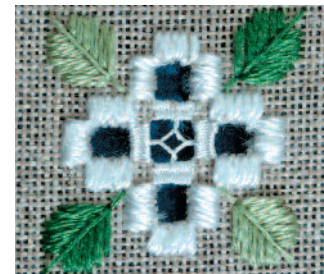
WORKING TOGETHER: Create Kloster Blocks with Silk Serica, woven bars with a matching color of Silk Bella and accent stitches such as leaves with Silk Mori.

This thin size of silk is perfect for woven bars in Hardanger, or for pulled work in samplers and canvas designs. Its beautiful lustre comes through when used in diminutive work like stitching on 40-count silk gauze or stitching over one on very fine counts of linen. Use it as a detailing thread, such as tendrils on a vine, spokes of a spider web, or fill-in areas of a blackwork design, for example.